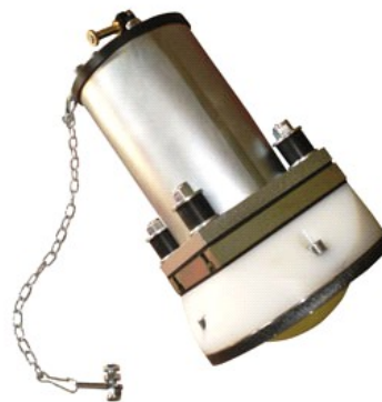
MARTSHOCK Pneumatic Hammer

To place your order today call ACT @ 1-888-480-0680