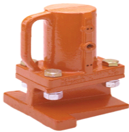
Portable Rail Car Vibrator

ACT also offers accessories such as various brackets for connecting the vibrators to the railcars. Installation is also available.